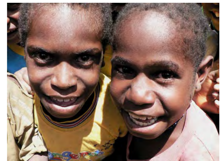
Children from the Dani tribe in the North Baliem region of Papua