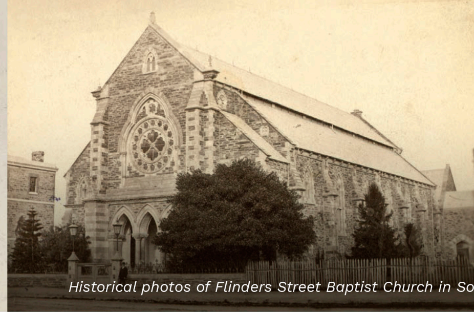
Historical photos of Flinders Street Baptist Church in South Australia