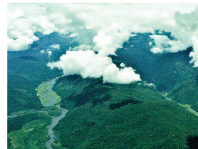
Mountains of the Central Highlands in Papua (nearby to the location mentioned in this story)

Above a satellite creased the clear night sky and our collective eyes turned towards the heavens and starry universe. It was a magical moment. All of us rejoicing in the glory of God.